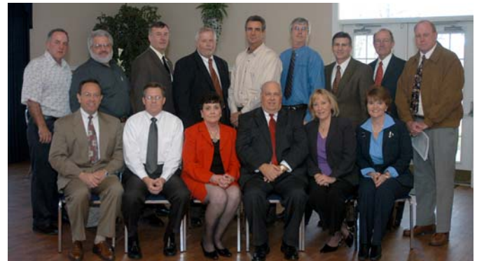
2007 LEDC Board Members, left to right:

I pray that God continues to bless our parish.